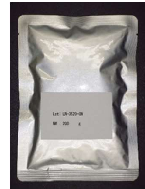
Neutral Al bag (optional)