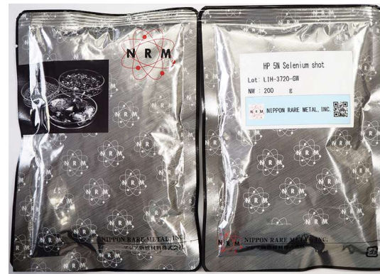
Optional Al bag with NRM logos

Optional : Al package purged with N2 gas for smaller size package